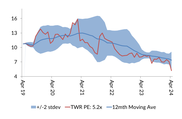
Figure 8. One year forward PE (x)